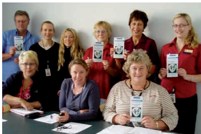
Wound Support Team members display their WST pamphlet during the April WST meeting.

We would love to have input into any patients with complex wounds from your area, so next time you have assessed your patient's wound to fit into the criteria as outlined above - think WST and send us an e mail - we would love to hear from you!