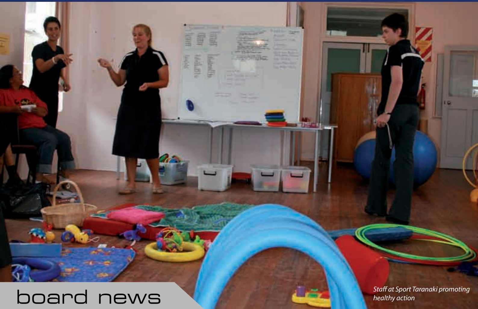
Staff at Sport Taranaki promoting healthy action