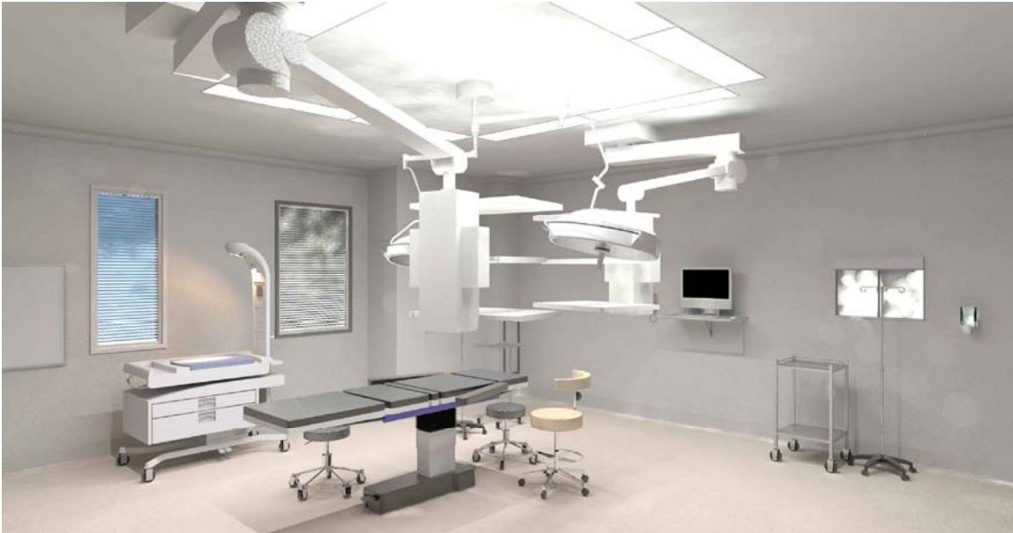
This image shows an operating theatre, with a pendant attached to the ceiling.

The developed design plans for Project Maunga have been reviewed by the user groups and 3D designs created. To see all the images go to the staff intranet.