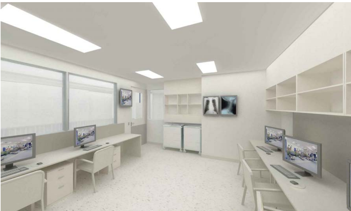
This image shows a work room that will be included in the new wards.